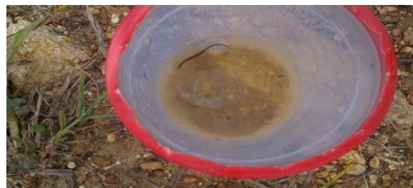
1b. Ventral view of the Leech Trap