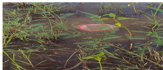
Plate 1a. Leech Trap

The Nigeria Leech Aliolimnatis michaelsoni distribution was studied in Minna North Central Nigeria. Ten sites were selected from clusters of ponds such that it can be sampled in three days. Leeches were collected using two trapping devices (Pennuto and Butler, 1993) and by visually inspecting the undersides of rocks. The two trapping methods were a metal funnel trap and a burlap sack. Funnel traps were 17.5cm tall and 14.5cm in diameter. The funnel was made of 1mm mesh plastic window screen with an apex opening of 1cm. burlap sacks measured 90 x 30cm with a mesh of approximately 1mm. a funnel trap and a burlap sack constituted a trap pair (Plates 1a and b). 10 trap pairs were baited with frozen fish parts and placed at 50m intervals in littoral areas (S 1 – S 10 ) at a depth of less than or equal to 1m, traps were set at dusk and retrieved at dawn. Captured leeches were counted and preserved in 10% formalin solution. Presence of vegetation, surface area, temperature, pH and conductivity were recorded.